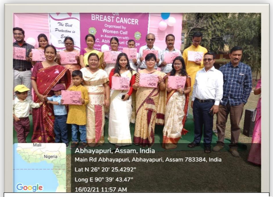
Signature Campaign Week on Breast Cancer 16/02/2021